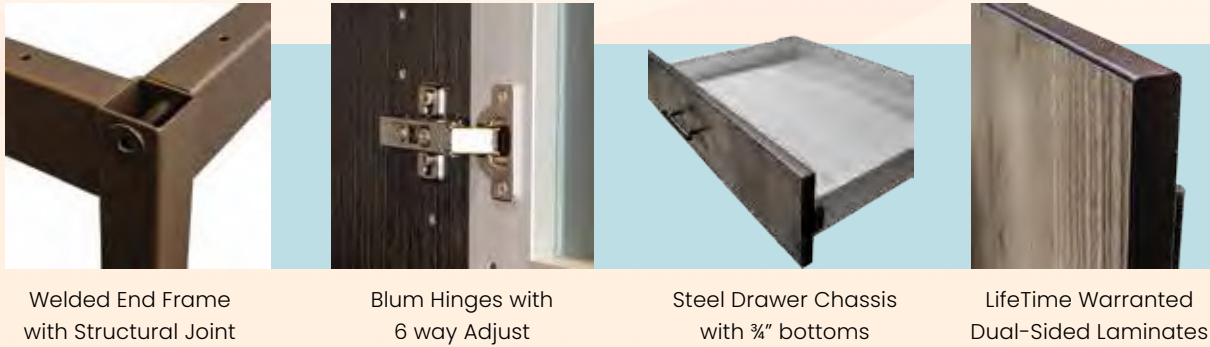
Welded End Frame with Structural Joint Blum Hinges with 6 way Adjust Steel Drawer Chassis with 3/4” bottoms LifeTime Warranted Dual-Sided Laminates