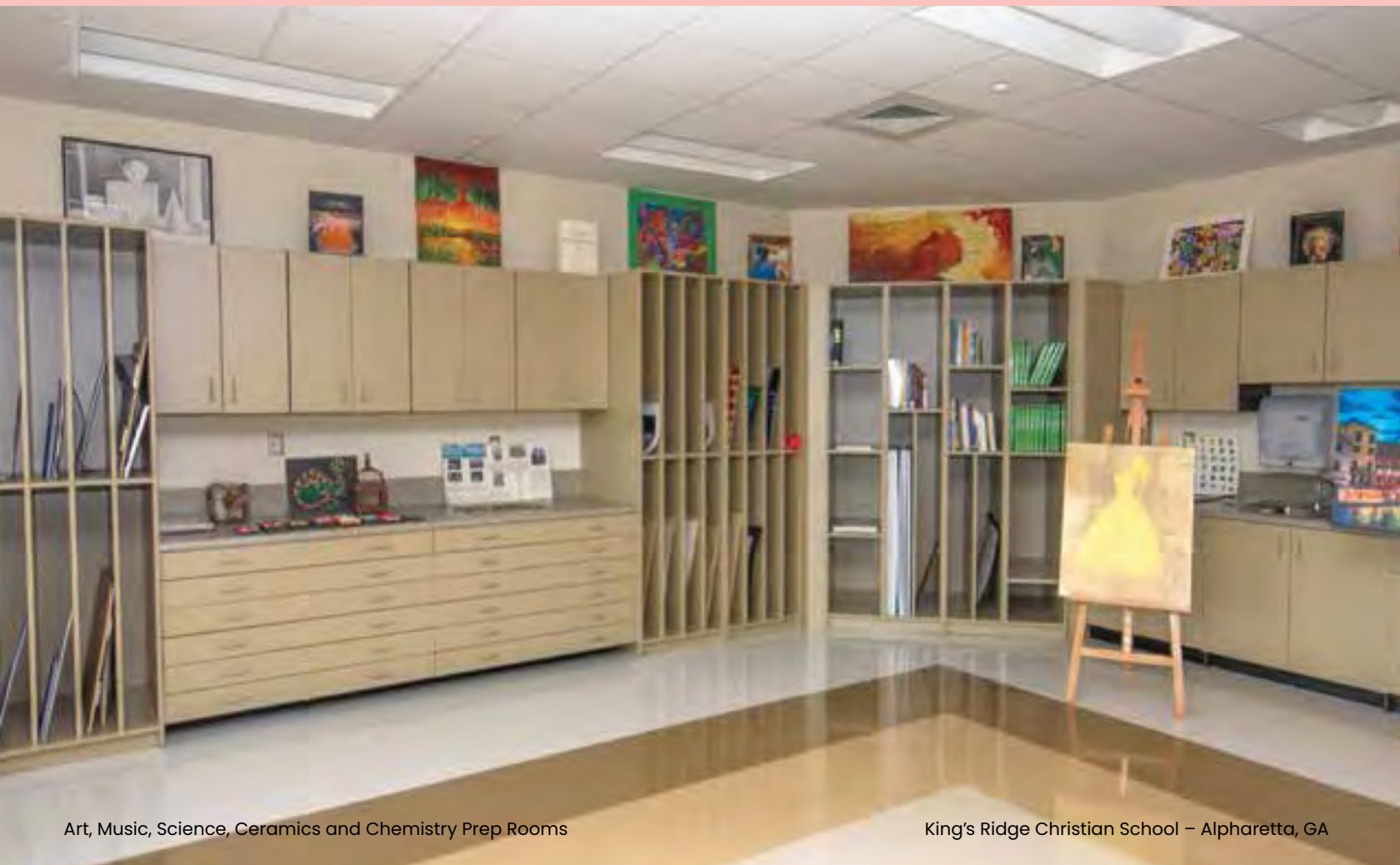
Art, Music, Science, Ceramics and Chemistry Prep Rooms