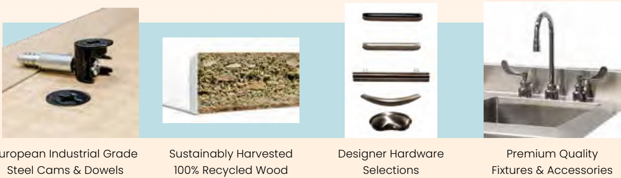
European Industrial Grade Steel Cams & Dowels Sustainably Harvested 100% Recycled Wood Designer Hardware Selections Premium Quality Fixtures & Accessories