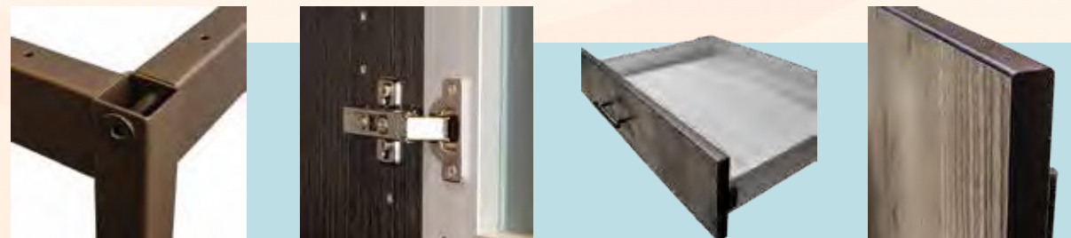
Welded End Frame with Structural Joint