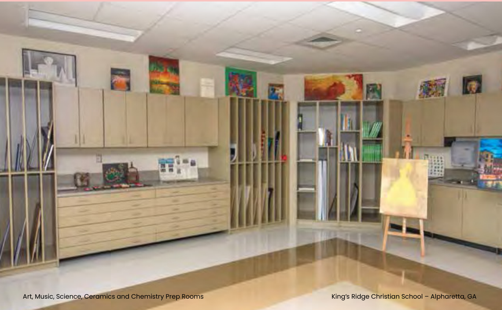
Art, Music, Science, Ceramics and Chemistry Prep Rooms